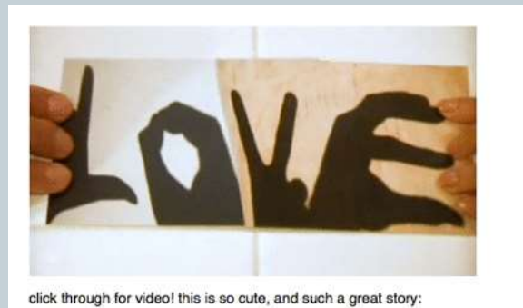
click through for video! this is so cute, and such a great story: