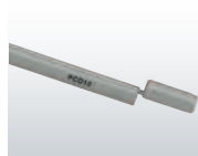
TROCAR WOUND CLOSURE