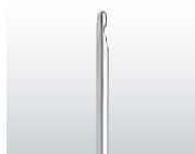
DISPOSABLE INSUFFLATION (VERESS TYPE) NEEDLES