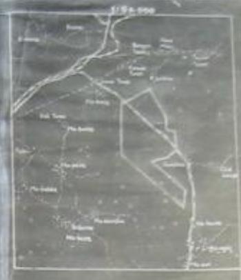
LOCATION MAP From the Survey SS [Scale 1:100,000]