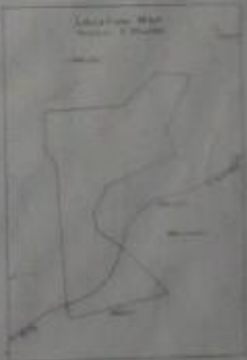
Inset Map - 1:10000