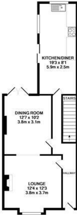
GROUND FLOOR APPROX. FLOOR AREA 527 SQ.FT. (48.9 SQ.M.)