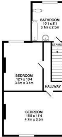
1ST FLOOR APPROX. FLOOR AREA 445 SQ.FT. (41.3 SQ.M.)

TOTAL APPROX. FLOOR AREA 971 SQ.FT. (90.2 SQ.M.)