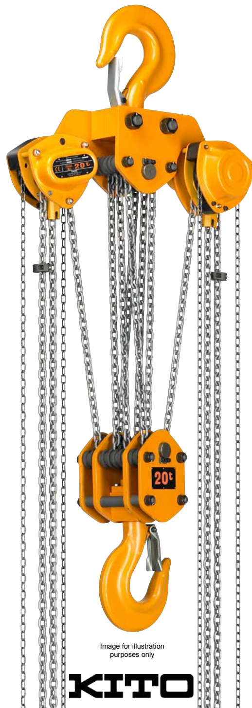
Image for illustration purposes only

Information subject to change without notice