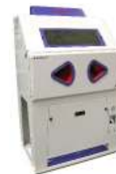
Cabinet above fitted with Armhole Sleeves Y1AA0011 (M101022 / 3421RS)