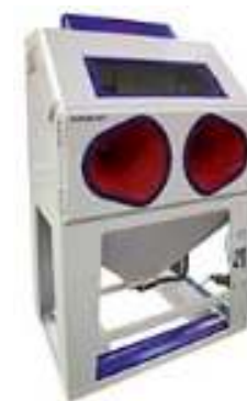
Cabinet above fitted with Armhole Sleeves - Large Y1AA0024