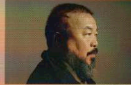
The Artist Ai Weiwei