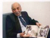
Latif Al Ani