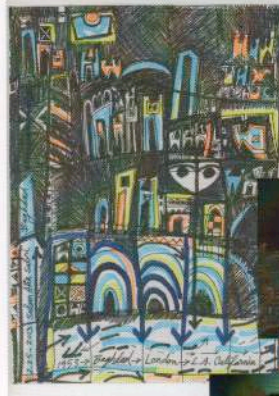
Salam Atta Sabri