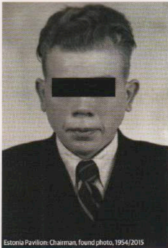
Estonia Pavilion: Chairman, found photo, 1954/2015