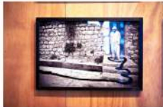
Akam Sheh Hadi Invisible Beauty (Installation view) , 2015 56th Venice Biennale