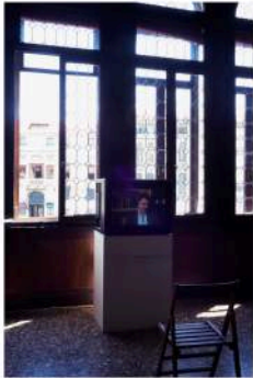
Rabab Ghazoul It's a long way back (ChikniPari I) (Installation view), 2015 56th Venice Biennale