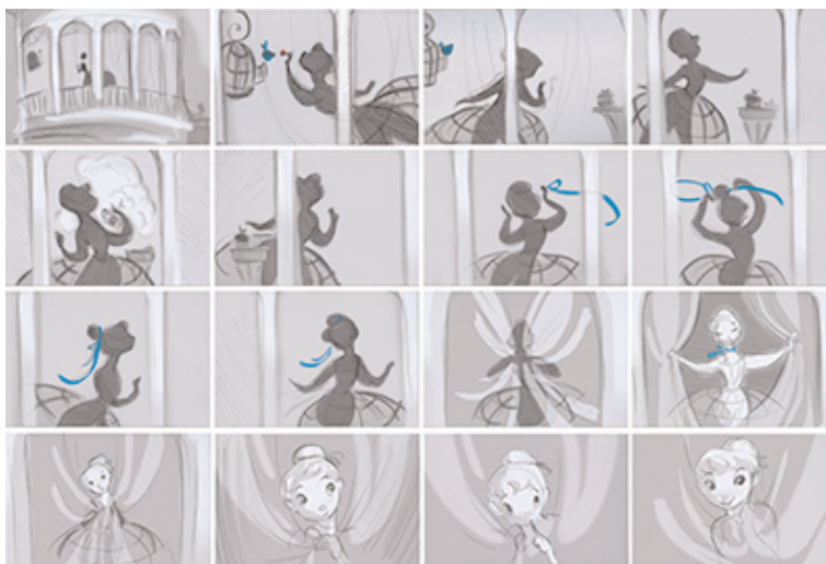
Live action reference and storyboard resulting from the reference

Please see the Flight of Fancy Animatic video on the 'The Traditional Animator' page of the Companion Website