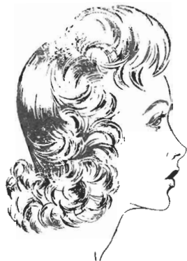
STYLE L. 15" HAIR AT NECK, 4" PARTING