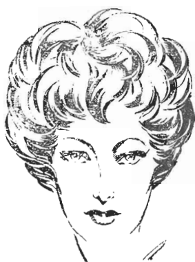
STYLE K. 5-6" HAIR NO PARTING