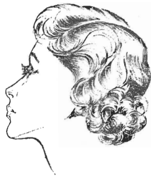
STYLE D. 8-10" HAIR 4" PARTING