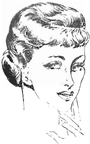
STYLE B. 8-10" HAIR NO PARTING