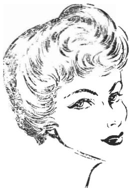
STYLE I. 5-6" HAIR NO PARTING