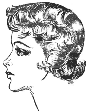
STYLE F. 5-6" HAIR 4" PARTING