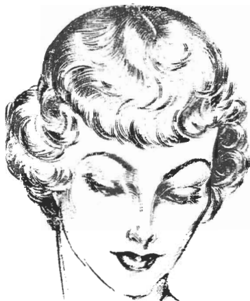
STYLE G. 5-8" HAIR 2 1/4" PARTING