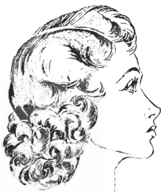
STYLE E. 14-18" HAIR 4" PARTING