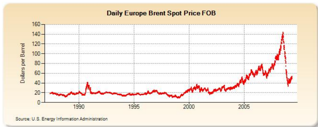
Figure 1 Daily Europe Brent Spar spot price, US dollars per barrel, May 1987–May 2009

Since its formation in the mid-1960s, much of volatility of global oil price has resulted from the influence of OPEC. In the 1970s when OPEC had over 45 per cent of the global production, prices tended to be high, when this share fell in the 1980s, price also fell. Global oil prices remained low through the 1980s and 1990s (US$20/bbl or lower), and although somewhat volatile through the 2000s, prices escalated rapidly, exceeding US$130/bbl by mid-2008 (see Figures 1 and 2 for the two commonly-used 'marker' prices). In the wake of the GFC, global prices are less than one-half of last years'; at the time of writing the spot price is US$53 a barrel. 4 Critical to understanding the implications of higher costs for imported oil is that the export of capital is a direct economic cost to the national economy – and a direct economic benefit to the exporter.