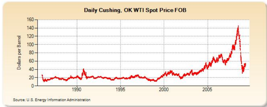
Figure 2 Daily Cushing Oklahoma West Texas intermediate spot price FOB, US dollars per barrel, December 1985–May 2009