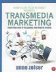
Anne's book: Transmedia Marketing: From Film and TV to Games and Digital Media ©Focal Press, Transmedia Marketing

can become your superfans. To activate them you must delight and challenge them with an array of transmedia content. Not only your film's content, but also content on various media platforms - together creating an overall story arc.