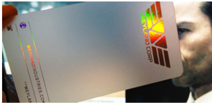
20th Century Fox

Later that month, the campaign designers used a more expected event, WonderCon in Anaheim, CA (a Comic-Con event) to boost excitement. Before the event, influencers including entertainment and fan bloggers and superfans received translucent Weyland Industries business cards with the logo, company Web address, and phone number, **WEYLAND. When dialed, the recorded message touted Weyland products and alluded to a big upcoming announcement. Callers then received a text message linking to a teaser video, "Big Things Have Small Beginnings," which was the first 20 seconds of the second key campaign video. It showed Weyland Industry's flagship android, the David 8, being unwrapped out of its product box.