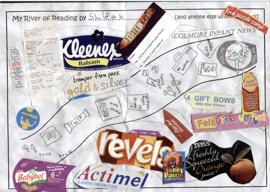
Figure W5.1.2 Shifah's river of reading