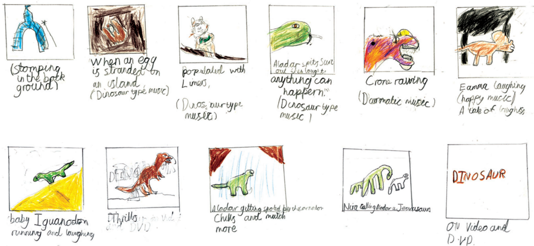
Figure W17.6.1 Max's Dinosaur trailer storyboard

Max's opening shows an assured multimodal text maker at work who makes decisions about the content to manipulate the audience, starting with 'When . . .': When an egg is stranded on an island populated by limers (lemurs) anything can happen. A tale of laughs, thrills, chills and much more. In this voice over Max shows that he has thoroughly grasped the features of the genre of a trailer, orienting the narrative as on an island but only hinting at what is likely to happen. His use of 'laughs, thrills and chills' shows good awareness of how trailers work. He integrates the modes not only to create interest, but narrative tension and atmosphere. The details of the dramatic action are created by the images, music and sound effects: using close-up and long- shots of happy dinosaurs, threatening predators and a frightened Aladar he keeps the viewer interested in the action of the film. Similarly, he hooks the viewer in by the stomping sound effects and 'dinosaur type music' before showing the images of the dinosaur and lemur and uses 'dramatic music' and 'happy music' to complement the images.