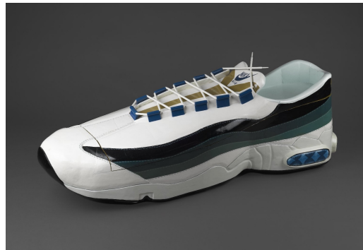
FIGURES 1 & 2 (Top) A Coffin Resembling a Fish. Tropenmuseum, part of the National Museum of World Cultures. (Bottom) Paa Joe (Ghanaian, born 1945). Coffin in the Form of a Nike Sneaker, mid-1990s. Wood, pigment, metal, fabric, 29 x 80 x 22 1/2 in. (73.7 x 203.2 x 57.2 cm). Brooklyn Museum, Gift of Lynne and Robert Rubin in honor of William C. Siegmann, 2000. 7

Fantasy coffins, called abebuu adekai (proverb boxes), honor the lives of the Ga, an ethnic group in Accra, Ghana during ceremonial funerals. Fantasy coffins began in 1950, when Seth Kane Kwei (1922-1992) constructed a palanquin formed in a cocoa-pod design for a festival to transport a Ga chief (Kane Quaye Carpentry Workshop, 2016). Due to the chief's passing prior to the festival, Kwei transformed his cocoa-pod palanquin into the chief's coffin. Shortly after, Kwei built an airplane fantasy coffin for his grandmother's funeral. She had always wanted to fly in an airplane, but never had the opportunity. Kwei's imaginative practice of thinking outside of the box to design coffins, revolutionized Ga funerary practices and established pathways for his apprentices, including Paa Joe (born Joseph Tetteh-Ashone in 1947), and his descendants to continue and evolve his fantasy coffins. Fantasy coffins are assembled, rather than carved, and take about up to two weeks to produce, costing between $250 and $1000. Those intended for burial are made of soft wood to disintegrate into the earth. Ones produced for museum collections are made of hardwoods and meant for preservation. Perceived as art, rather than a temporal instrument, they are fully removed from their funerary roles.