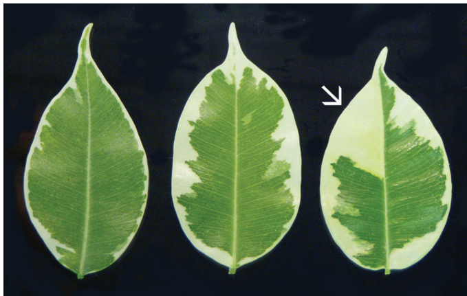
Figure OM10.1-1 Albino and green sectors in Ficus leaves.

Clonal analysis has provided important information on how cell division is regulated to build the different organs of a plant and on the question of whether differentiation depends on a cell’s lineage or position – in the case of plants the answer is in most cases cell position.