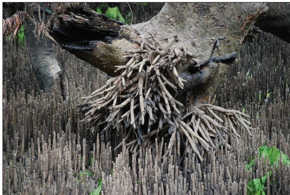
Figure OM13.1-1 Mangroves. (A) Pneumatophores of Avicennia marina in South Australia. (B) Stilt roots of Pelliciera rhizophorae in Costa Rica. (C) A mangrove swamp in Okinawa, Japan. Stilt roots are visible in the foreground.