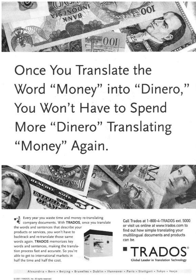
Figure 3 Trados advertisement

Cuando hayas traducido la palabra ‘dinero’ a ‘money’, ya nunca tendrás que gastar más ‘money’ traduciendo ‘dinero’.