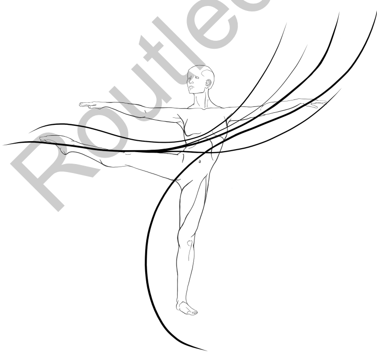
Figure 12.1 A soft ocean breeze carries the upper body into space