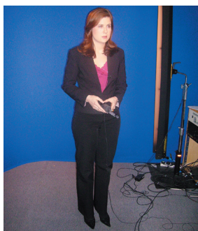
Emma in the virtual studio