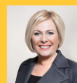
Halla Tómasdóttir CEO of The B Team and candidate in the 2016 Icelandic presidential election from Reykjavik, Iceland