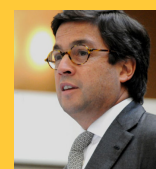
Luis Alberto Moreno President Inter-American Development Bank Washington, D.C., USA