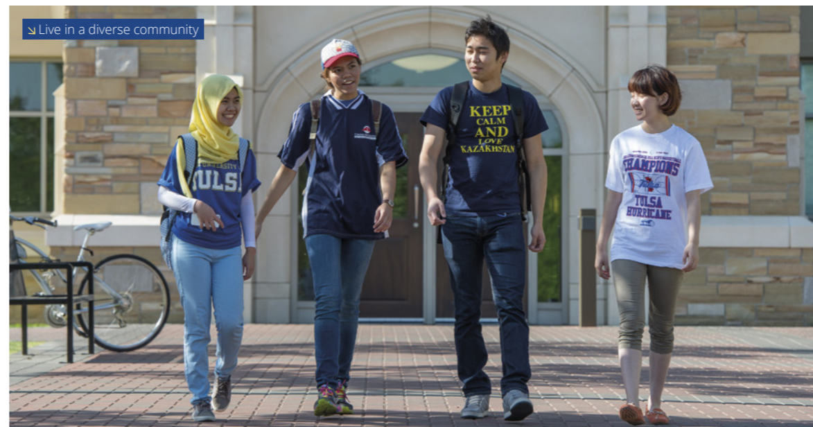
▶ Live in a diverse community