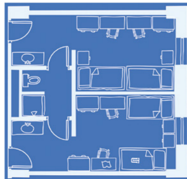
↓ Example of double suite room