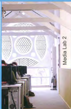
Media Lab 2