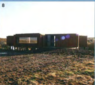
1 Centre for Competitive Creative Design Niall McLaughlin Architects