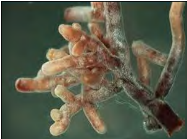
This mycorrhiza includes a fungus in the genus Amanita

Mycorrhizal fungi form a symbiotic relationship with the roots of most plant species (and while only a small proportion of all species has been examined, 95% of these plant families are mycorrhizal). They are typically found in the rhizosphere of a root system.