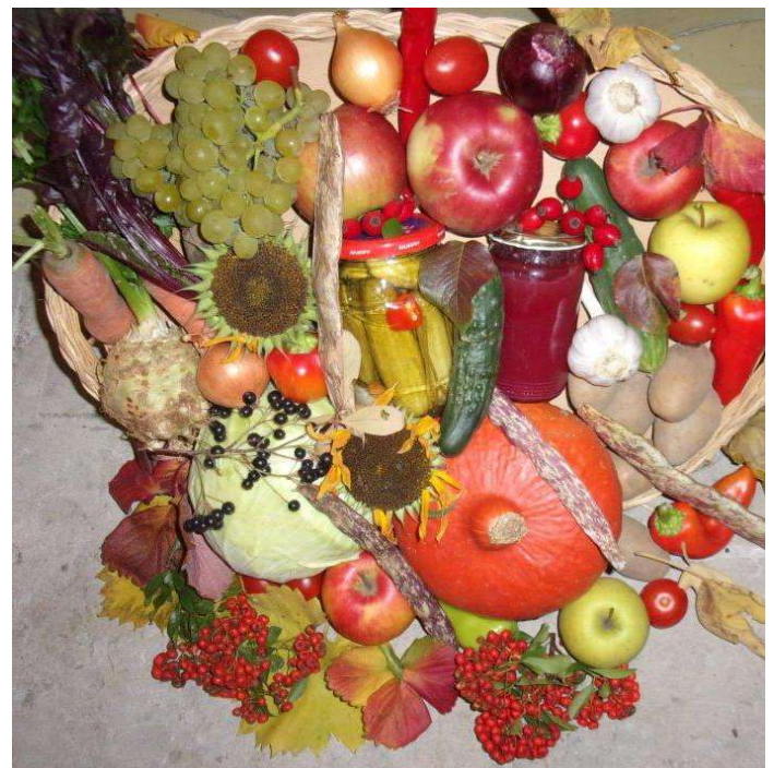
Harvest thanksgiving in Libis

St Bride's had their Harvest Thanksgiving on Sunday 1 st October when all our donations went for the homeless in Inverness. Below is a picture of part of the Harvest Thanksgiving presentation in Libis.