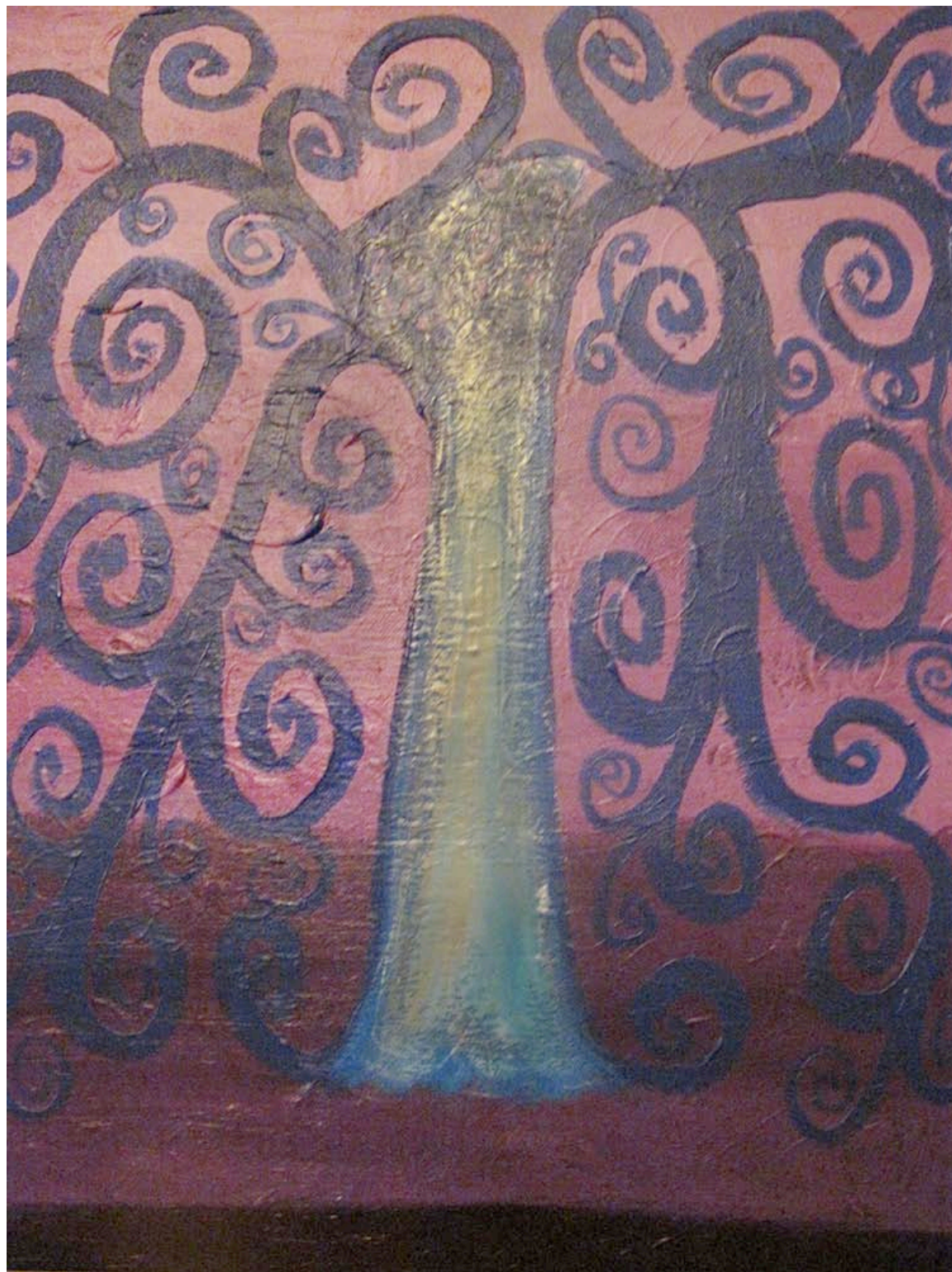
Figure 2: Spiral Two