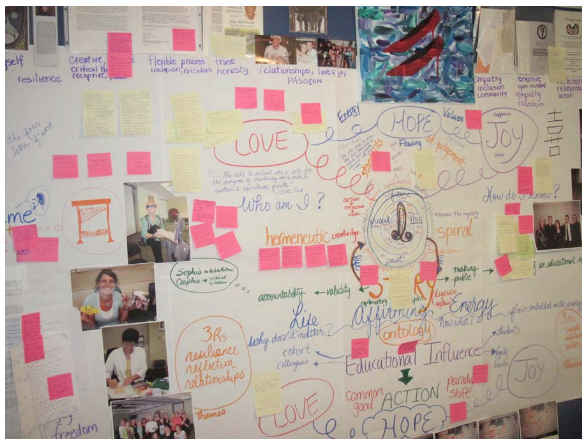
Figure 8: The Living Wall