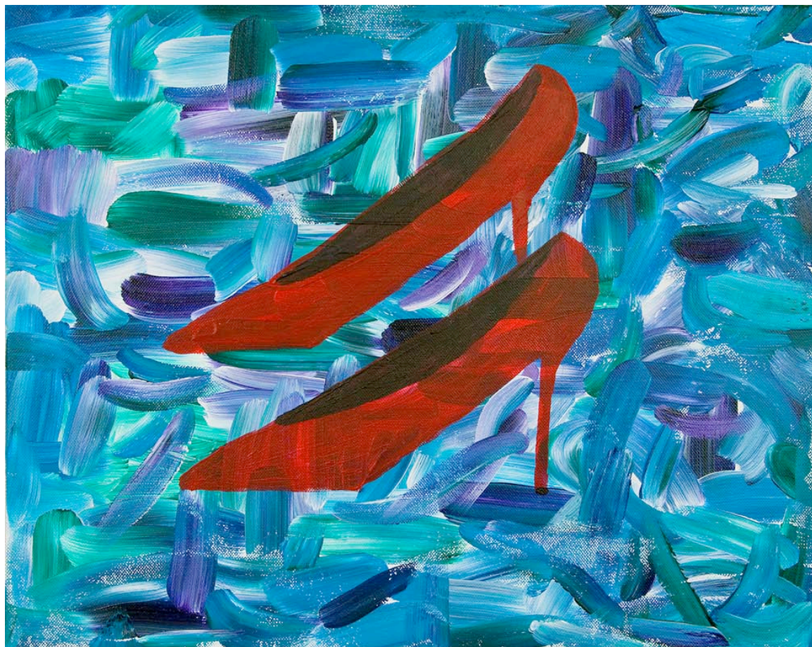
Figure 3: Pumped