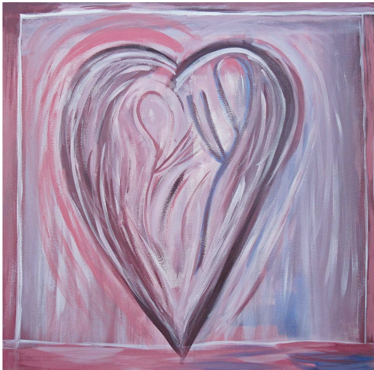
Figure 9: Signed Weezie