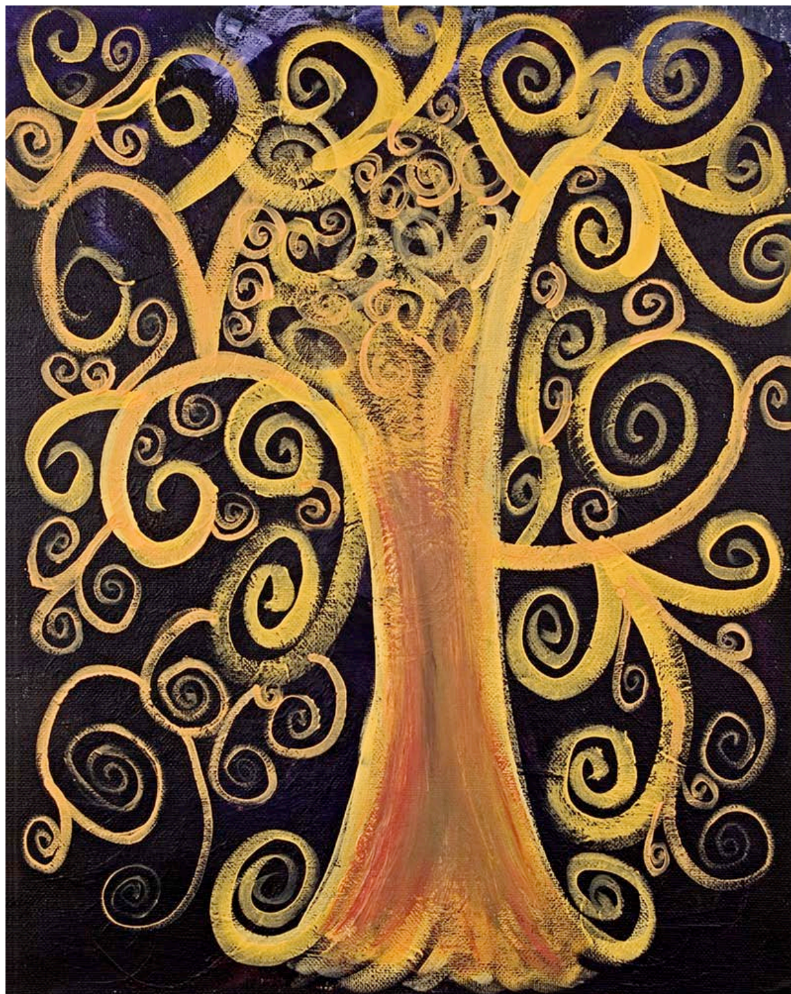
Figure 1: Spiral One