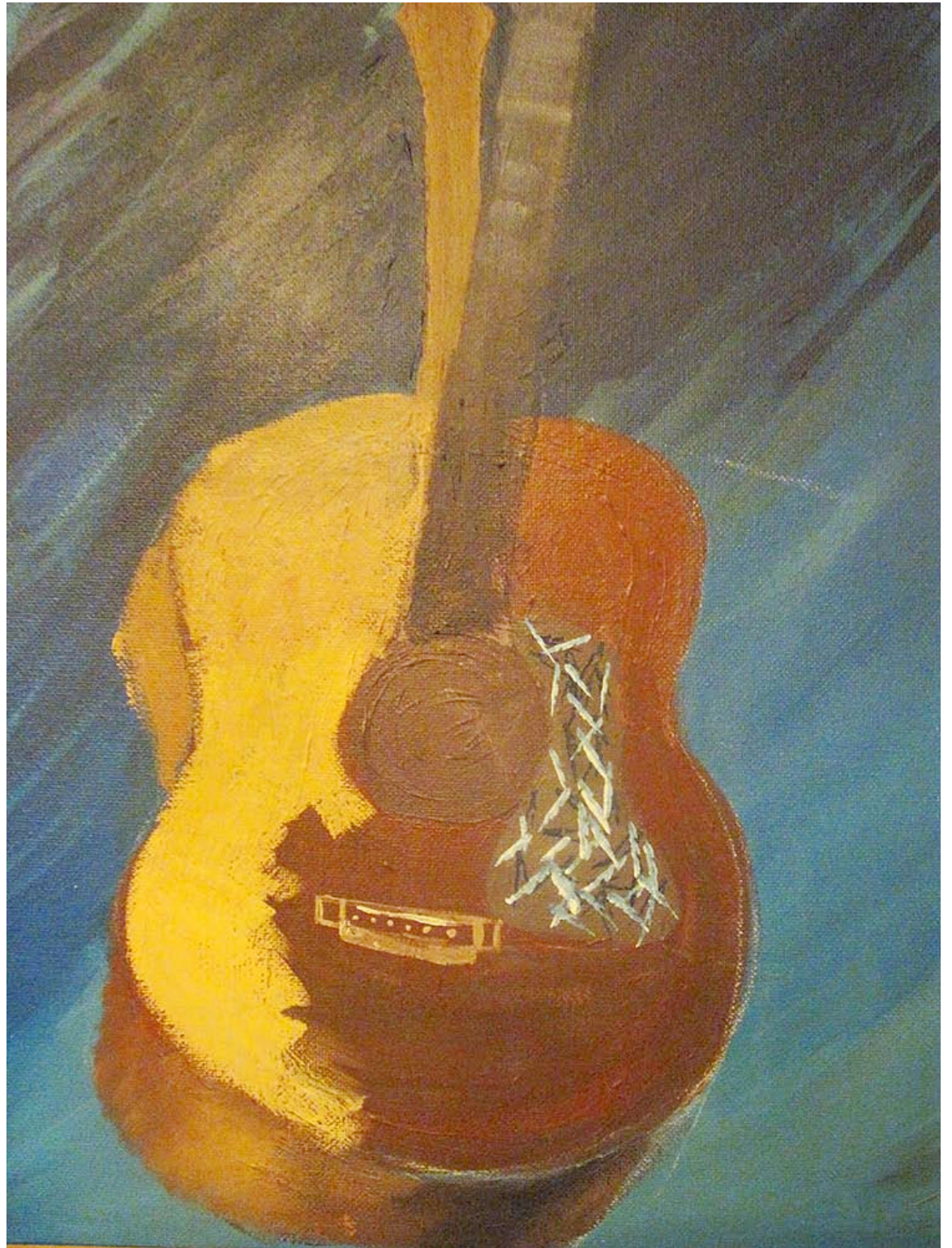
Figure 5: “Broken Guitar”