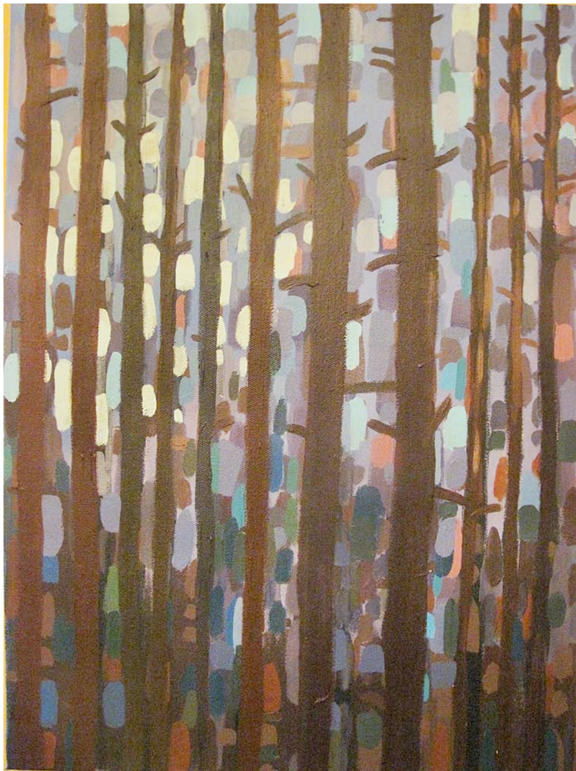
Figure 4: “Borrowed Harmony”