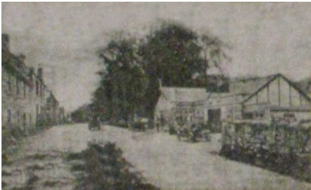
Evanton from the west, featuring McKenzie's Garage