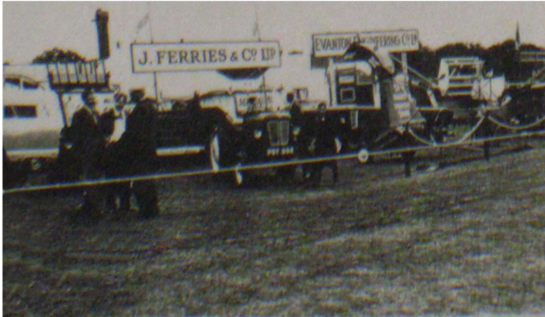
Evanton Engineering at the Black Isle Show.