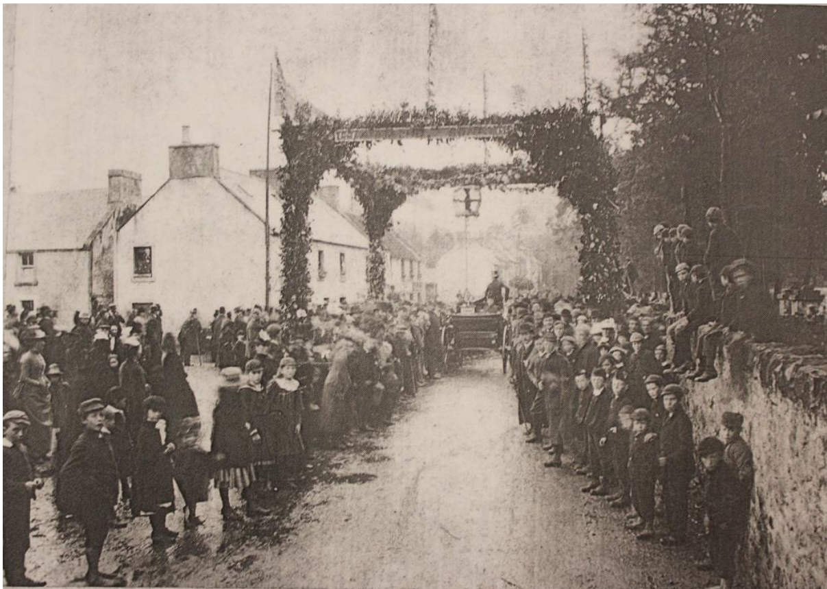
Evanton welcomes the bridal carriage

The triumphal arch in Evanton ( see photo ) read “Welcome to your Highland Home” and “Aonachd Sona” (A Happy Union). Further arches read “Dread God” and “Erin go Bragh” and “Ceud Mile Failte”.