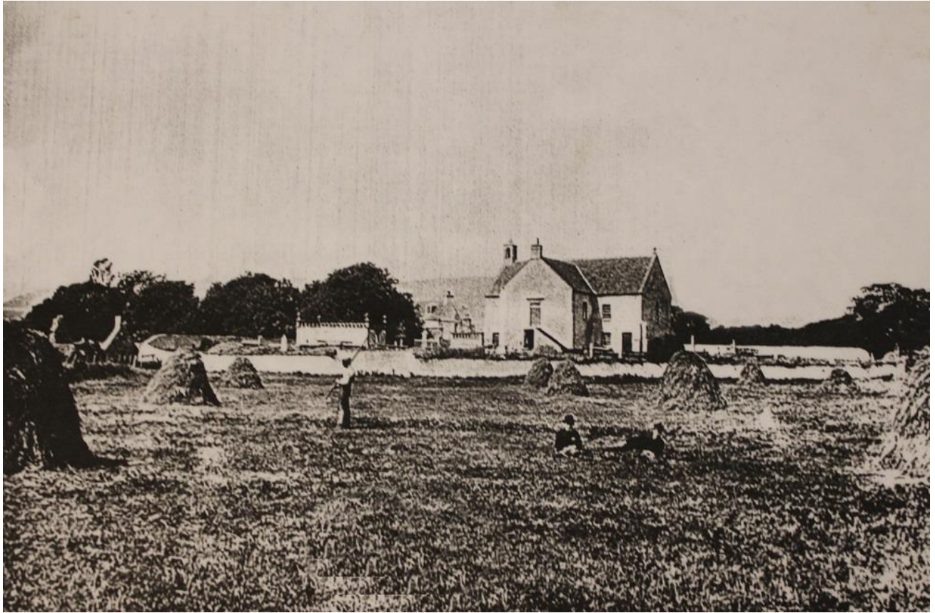
Kiltarn Church, turn of the century 1890s-1900s