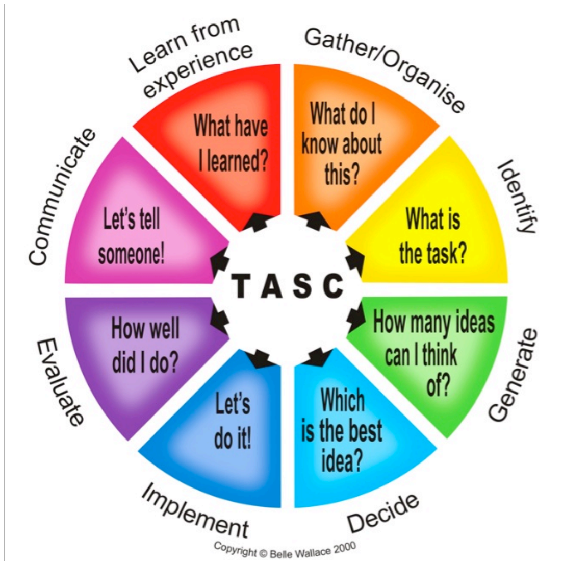
Figure 2. TASC (Thinking Actively in a Social Context)

(Wallace & Adams, 1993) to create and contribute validated knowledge of self, self in and of the world, and of the world.