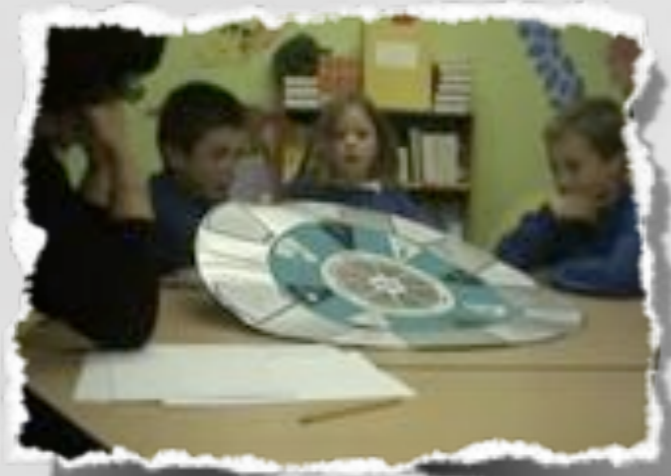
Learning at Chew Stoke