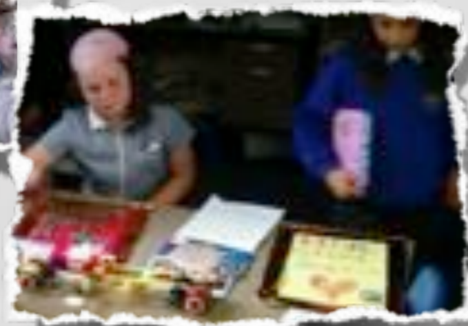
TASC Days at Camerton