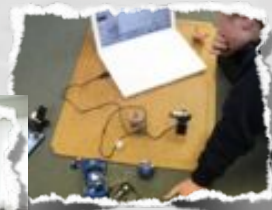
Discovery at Swainswick

Everyone Starts With A General Passion For Learning & Can Develop Particular Passions For Learning.