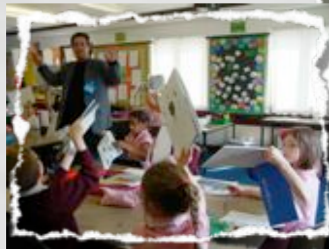
Collaborative, creative artists at St Mary's Bathwick