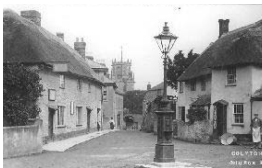
Church Street Colyton, date unknown