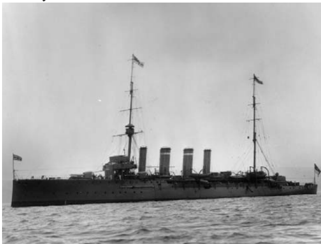
HMS Falmouth 1910