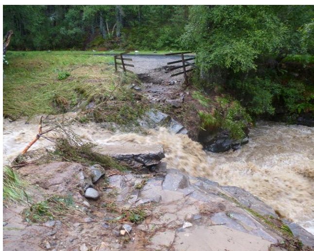
The site of the bridge on the morning of 11 th August 2014

over £6000 from the Peoples' Postcode Trust and we are currently one of the recipients of funding through Tesco's Bags for Help scheme, so please ensure that if you shop there you vote for the project in store at Aviemore over March and April.