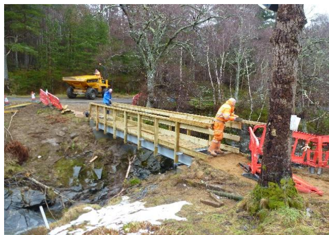
The replacement almost complete. February 2018