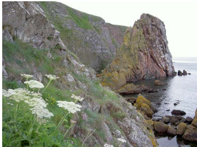
The rock on the left is aptly named the breeks.

Generations have come and gone but, as they say, the rocks remain. Partanhall cottages are showing every sign of surviving too.