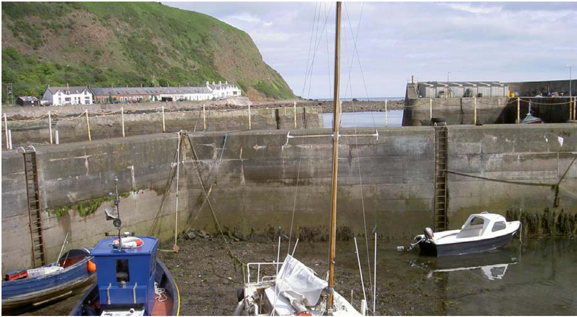
A view of the harbour with Partanhall in the background showing that, at a distance at least, Partanhall has changed very little.