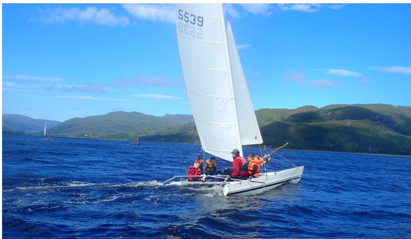
Sunday Sailing 2022