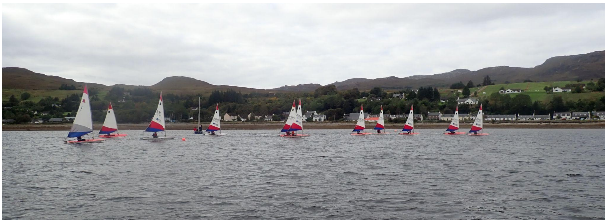
Gunn Trophy 2022

Comet 1210 Omega 1075 GP 14 1133 Comet trio 1096 Pico 1330 Vago 1071 Laser 4.7 1210 RS Feva 1248 Fireball 952 Laser radial 1150 RS Vareo 1093 420 1100 Laser full 1101 Topper 1369 Fusion 1300 Laser 2000 1114 Wayfarer 1105 Dayboat 1184