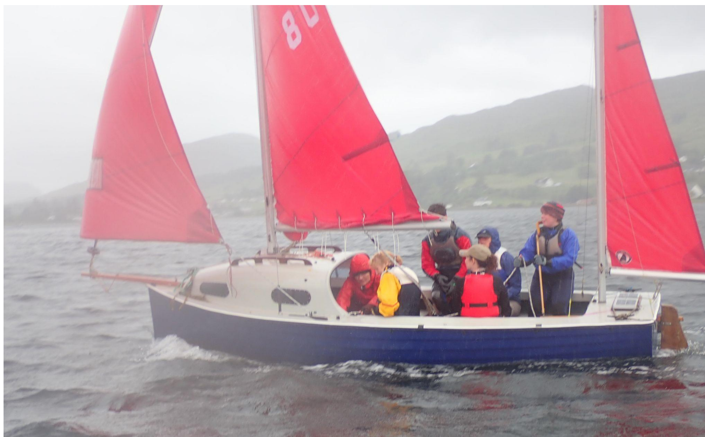
Training week 2022