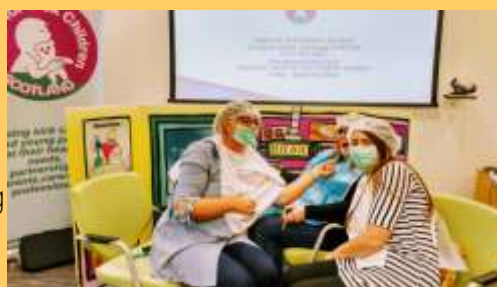
Dental staff at the Glasgow training session explore how to use play to communicate with children. Training days for 2017 will be advertised via the NES portal

The training will provide an understanding of children's play with the aim of helping dental staff to communicate better with children in their care. To complement this learning, a Special Smiles Dental Play™ Box will be loaned to each Board area courtesy of NES.