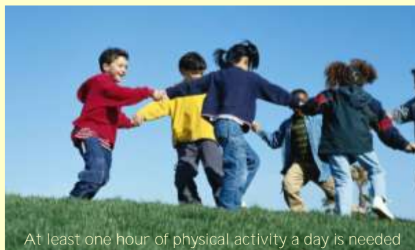
At least one hour of physical activity a day is needed

The consequences of obesity in children and young people include heart disease, insulin resistance and type II diabetes, dyslipidaemia, high blood pressure, psychological and social morbidity, asthma, impaired fertility, orthopaedic issues, breathing problems and sleep apnoea, fatty liver disease, association with some cancers (more so than smoking) and persistence of obesity into adulthood. The management of such health conditions is likely to have a significant financial impact on the NHS and society given that childhood obesity can often last into later life. Children and young people can suffer emotionally as they may be bullied or lack confidence and self esteem. With this in mind, and in an aim to address an increase in the