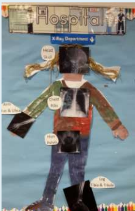
An interactive wall allowed children to display Velcro x-rays of different parts of the body

display with velcro x-rays of different parts of the body.