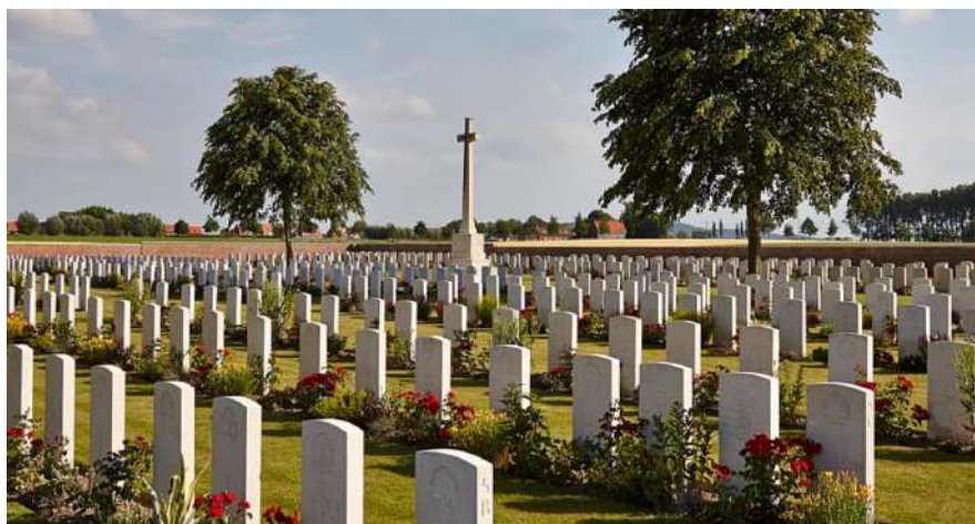
The Huts Military Cemetery, Dickebusch