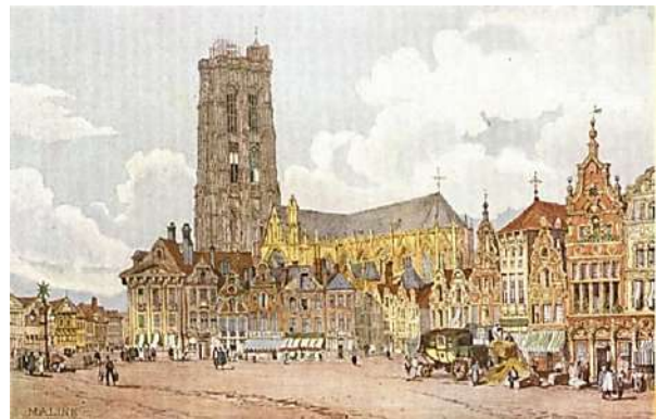
Pre-War Malines Cathedral and the Grand Place