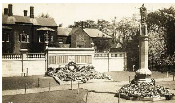
Hinckley War Memorial, 1923

On 20 th May, the Branch was also represented at a Service in Hinckley to mark the centenary of the unveiling of the town's War Memorial in 1922. Situated on Castle Hill (part of the remains of Hinckley Castle) the Memorial consists of an octagonal column on a stepped base, surmounted by a robed figure representing an Angel of Mercy, whose outstretched arms were designed to cast a shadow on the names of the fallen on Armistice Day.