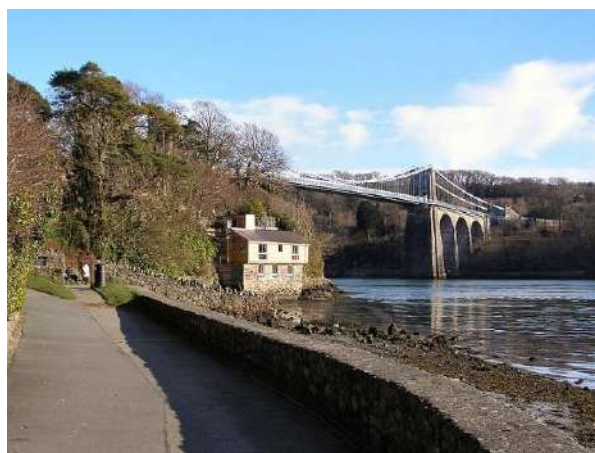
The Belgian Promenade, Menai Bridge

The Belgian refugees were very grateful to the people of Menai Bridge for providing them with food and shelter. As a gesture of thanks and appreciation of the hospitality provided to them, the refugees constructed a promenade along Menai Strait foreshore. It was approximately a 500 metre long walkway that extends from Carreg yr Halen (small tidal island), close to the Menai Bridge, and the Causeway at Church Island (Ynys Tysilio). It is understood that most of the Belgian men were skilled in marquetry. The Urban District Council provided all of the materials and equipment. The promenade was completed in early 1916 and the refugees who