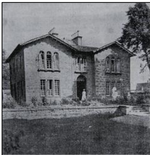
Nairn Fever Hospital 1933