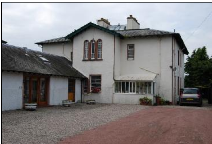
Nairn Town and County Hospital showing 1880s fever wing

left in the photograph below). 17 It had two wards and a nurses' room but lay unfurnished until 1892 when the new County Council and Nairn Burgh i each paid £20 for furnishings under a tripartite agreement with the hospital trustees. Similar arrangements existed elsewhere such as in Lochaber and Caithness.