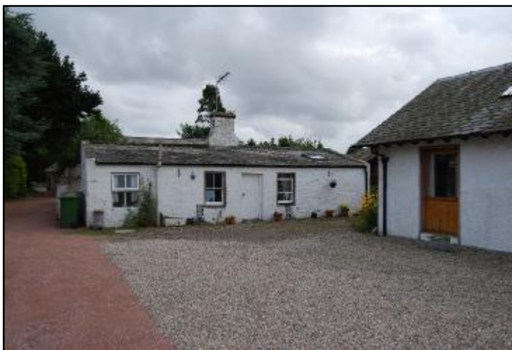
The separate laundry block with the fever wing on the right

In 1900, the directors offered four beds to the military during the South African war but these were not taken up. 20