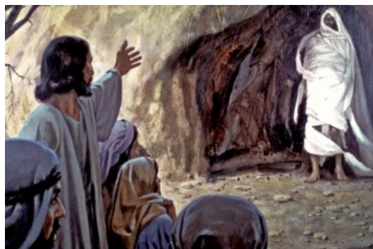
Lazarus rising from the dead