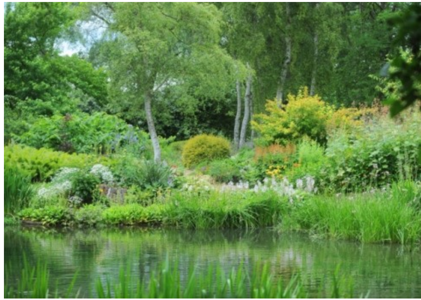
May - Fuller's Mill Gardens