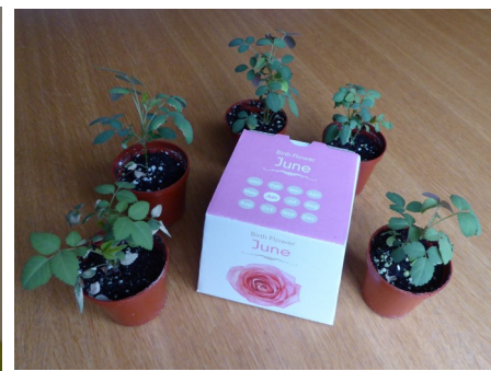
Daphne's miniature roses