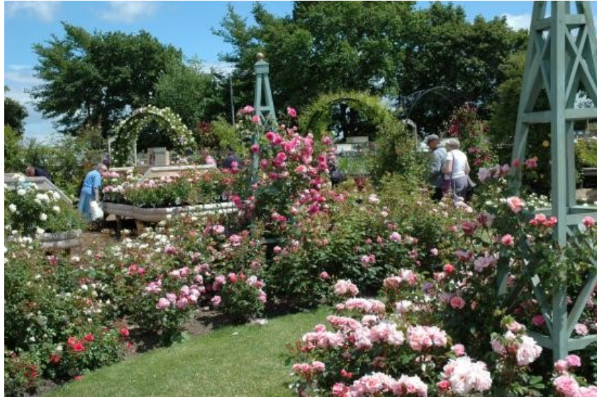
June - Peter Beales Roses