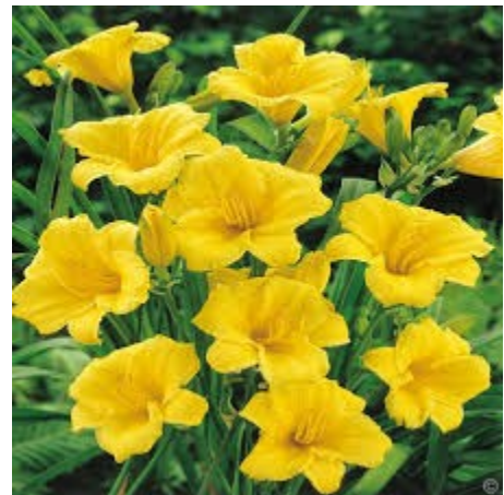
Edible hemerocallis - the yellow ones are the most flavoursome

10. Hemerocallis (day lily) petals are edible