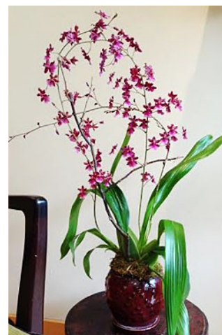
Oncidium (orchid) 'Sharry Baby' smells of chocolate