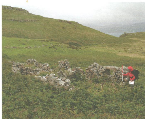
Recording the township ruins during the archaeological survey.

was identified from cartographic sources and from the results of an archaeological assessment and survey of the island undertaken in 1998. The survey produced a database of recovered sites on the island, although this lacked detail relating to individual structures and wider settlement evidence (such as field boundaries and areas of relict cultivation).