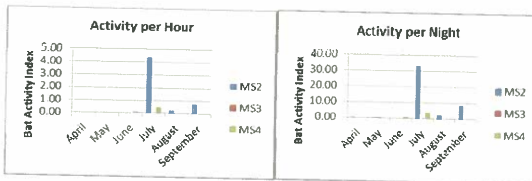
Chart 7.2: Overall Bat Activity per hour and per night

7.116 Chart 7.2 below shows the overall bat activity per hour and per night for common pipistrelle across the survey period.