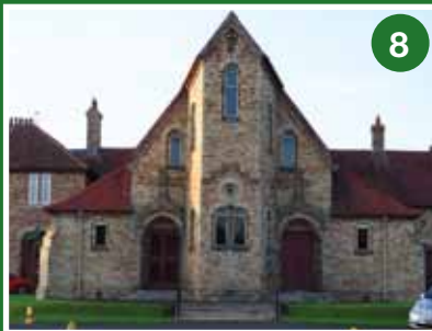
St Matthews RC Church