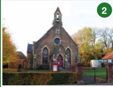
Rosewell Parish Church