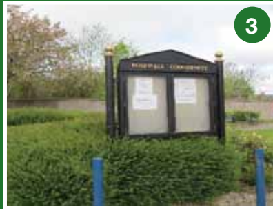
Community Notice Board