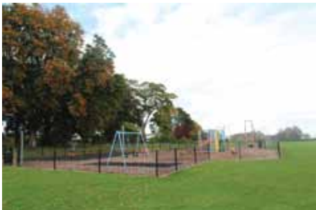
CHILDREN'S PLAY PARK