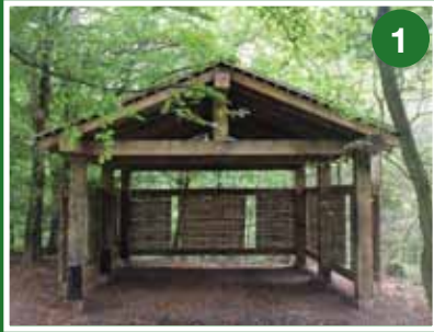
RDT Woodland Classroom