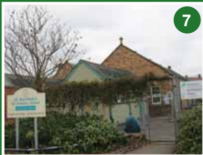
St Matthews Primary School