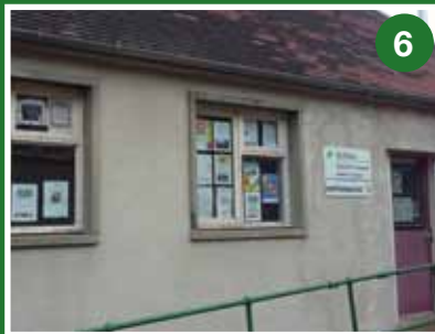
RDT Resource Centre