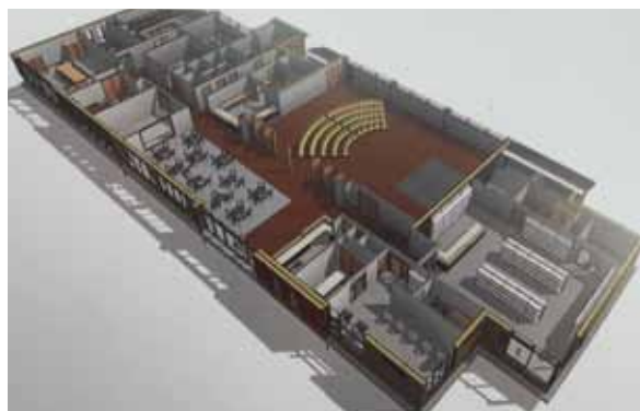
Initial plan of inside the Rosewell Community Hub – to be located on the corner of Carnethie Street & Gorton Road.

The Hub will greatly enhance the work that RDT currently deliver and will offer all the facilities our growing community requires including a multi-functional large main hall, soft play, café bar and sensory space.