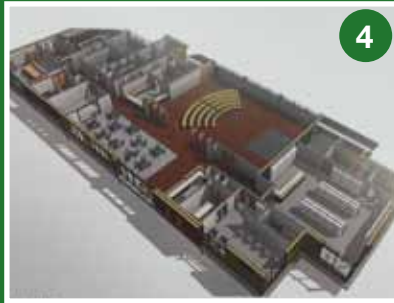
RDT Community Hub