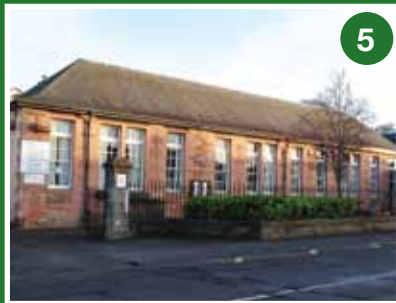
Rosewell Primary School