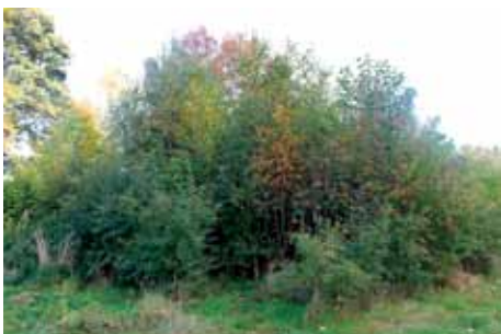
ONGOING DEVELOPMENT OF THE COMMUNITY MAZE