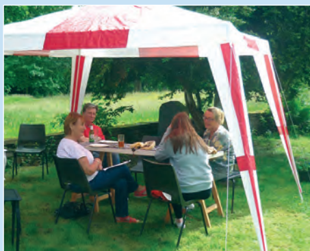
St Andrew's Church will be open during the festival.

Entry to the Arts Festival is free, and there is ample free parking.