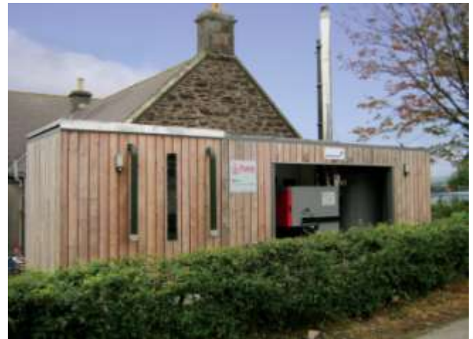
The boiler located next to the Hall

Apart from the practical purpose of providing heat, the project aims to promote renewable energy and be used as a test case to see what technology works. Providing information on the project is therefore an important aspect and the signage is an example of this.