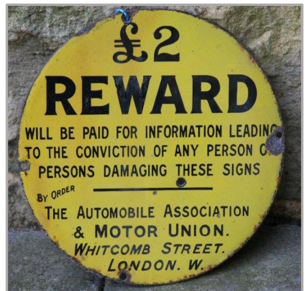
Sign erected below the main sign to attract small boys' catapults