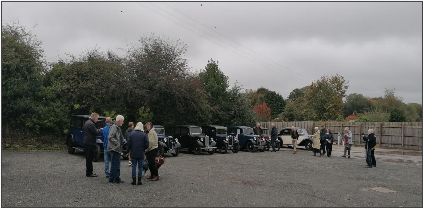
Time for old friends to meet up for one last rally this year