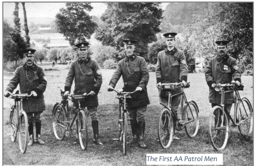
The First AA Patrol Men

By 1932 the Association had erected almost 30,000 signs in towns and villages across Great Britain. Most were removed during the Second World War when a Nazi invasion seemed highly likely. At the end of the war, only six hundred or so remained, including the St. Tudy sign, which disappeared years later. There are currently around sixty-five original signs throughout Great Britain although many have survived in museums and private collections.