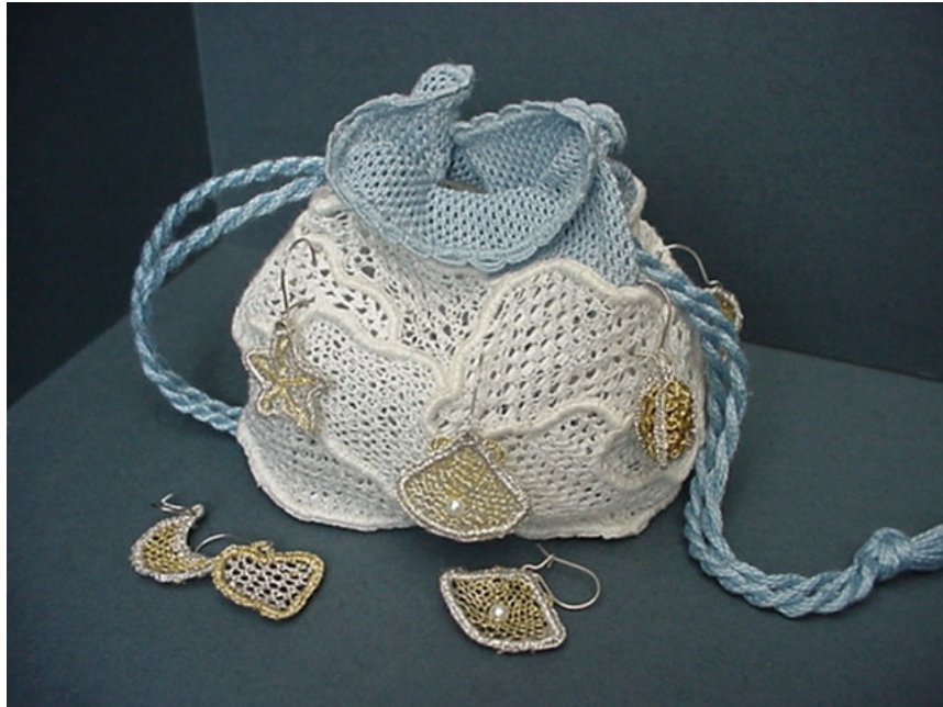
Purse in Needlelace